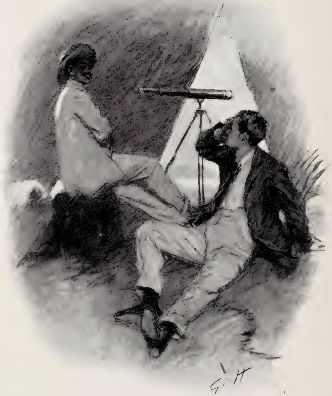
" He saw his chief seated on the stump that did duty for a chair." Young Lord Stranleigh [Page 131.